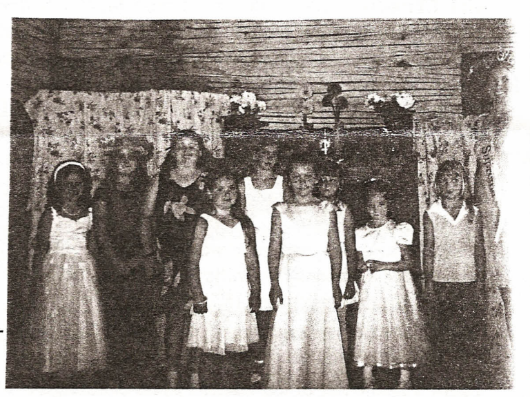
Lil' Miss Rhubarb contestants & MC 2005

5 pm - Hear stories of hauntings 6:30 pm - See pictures & photos Also, Prize Awarded for best Adult Costume - Judging ⊕ 4:30 pm Refreshments available. $3.00 donation is requested.