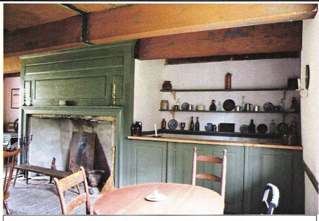
Fireplace and Bar Area after

Research and a restoration plan in hand, we sought a contractor who would faithfully execute the plan and be willing to work