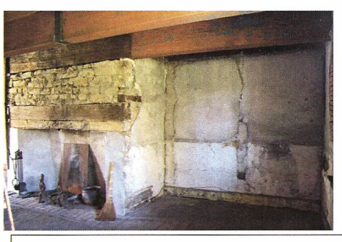
Fireplace, Bar Area before (R.Burch)

Prior to 1800, the tavern structure was only one-and-a-half stories high. The addition of a two-story section to the east in the early 19th c. necessitated removing the north cupboard area in order to cut a door into the new addition. A bar was apparently created in the south cupboard area, possibly by simply cutting the paneled wall in half horizontally and installing a plank shelf to create the serving surface.