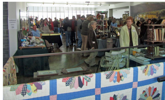
2012 Antique Show at Arkell Museum