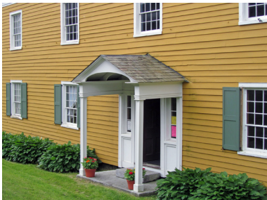
7355 State Rt. 5, St. Johnsville, NY