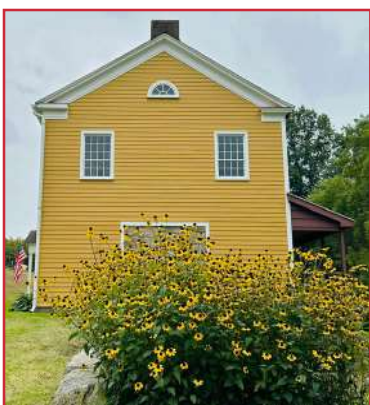
7355 State Rt. 5, St. Johnsville, NY