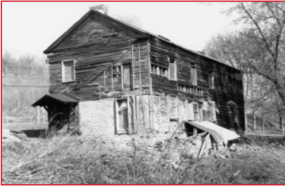
Nellis Tavern 1983

Palatine Settlement Society PO Box 183 Saint Johnsville, NY 13452