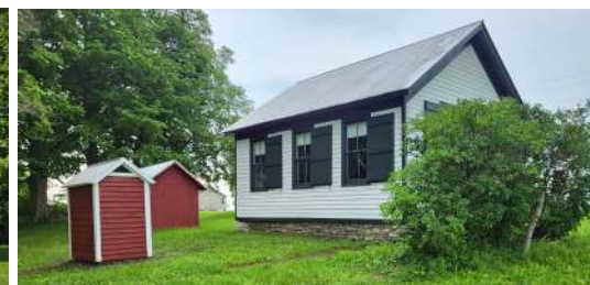
After, ashes, odor control